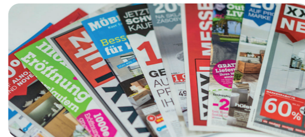
Tailor-made software solutions for flyer production

The detailed planning of publications is now supported in the campaign management solution and, where possible, executed automatically. With sophisticated rights and role management, user capabilities were defined within the solution. The solution met the goal of establishing an efficient and error-free production process. Ensuring consistency and reliability of media assets has given them a huge advantage. Premedia's solution is now used to produce countless other publications such as mailings, advertisements, pricebooks, packaging and more.